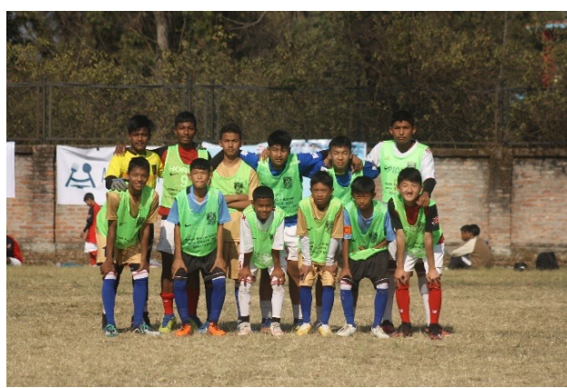
U-15 Japanese Players