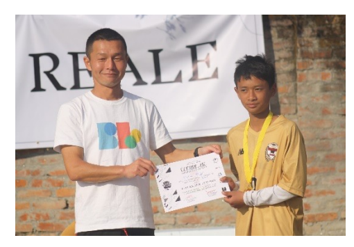
Participation Certificate Distribution