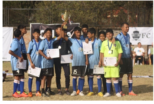
Team Bhairav - RUNNER UP