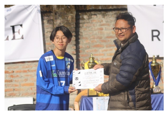
Participation Certificate Distribution