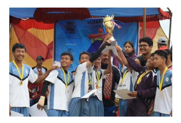
U15 Winner – Team PuluKishi