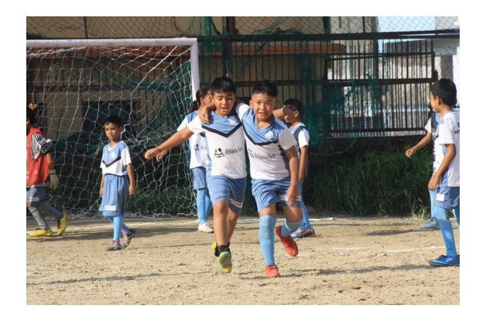
Medals and trophies may fade, but the memories collected at the U15 Reale Cup will forever shimmer. In the vibrant tapestry of shared meals, electrifying games, and open-hearted conversations, kids unlocked a treasure trove of self-discovery. They learned to navigate differences, celebrate triumphs, and forge friendships that transcended backgrounds, proving that the true gold of this tournament lay not in trophies, but in the hearts they touched.