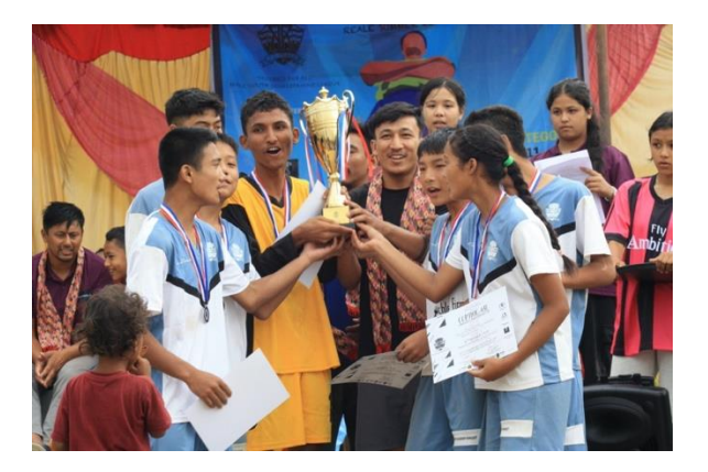
U15 Runner Up– Team Lakhe