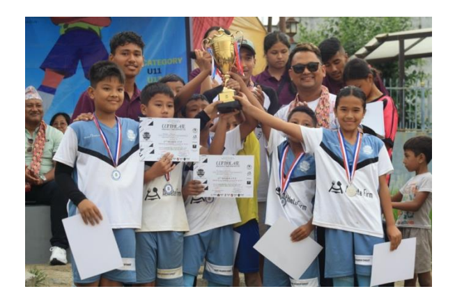
U11 Runer Up – Team Narsimha