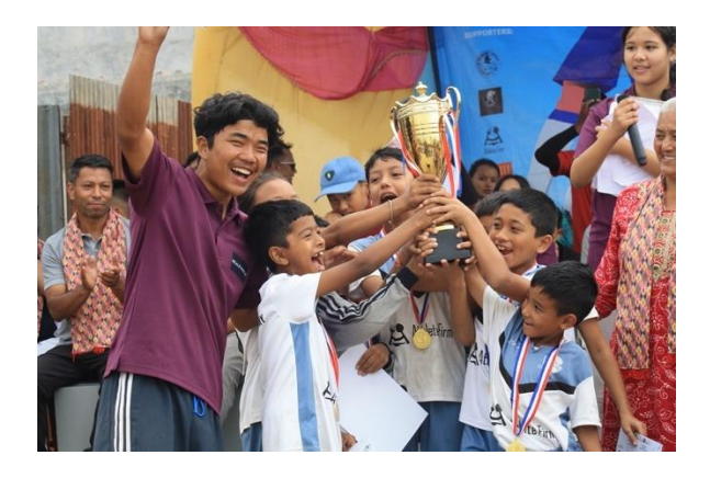
U11 Winner - Team Lakhe